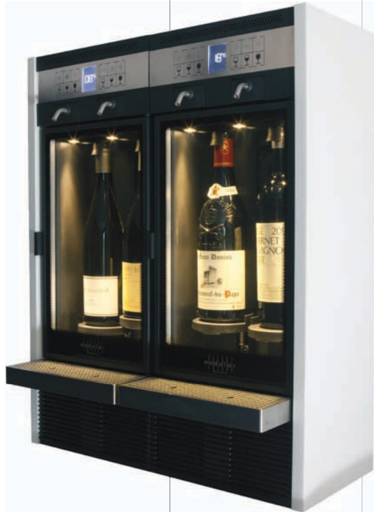
2 consecutive units

The system can be positioned stand alone, mounted to the wall or can be completely built in a wall, kitchen or cabinet