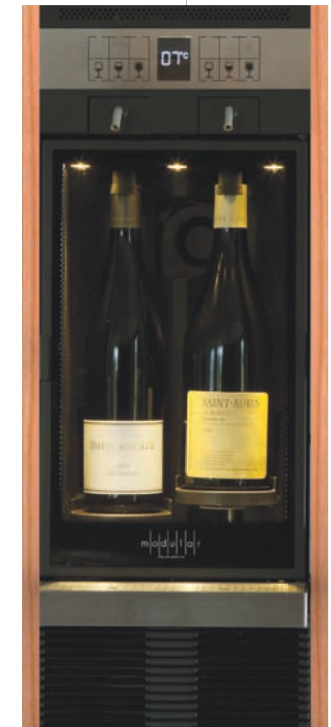
1 unit stand alone